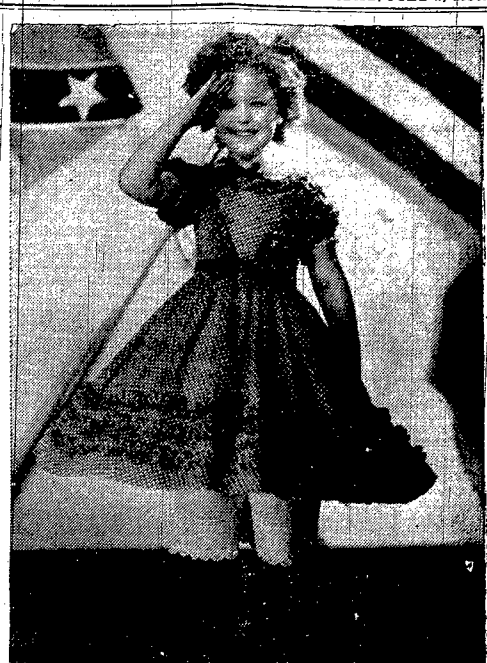
She storms your heart as the sweetheart of the South in "The Littlest Rebel". In the Fox picturization of the play all America cheered, SHIRLEY TEMPLE heads an all-star cast, sings new songs, does new dances.